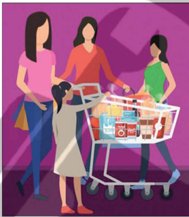
National Consumer Day 24th December

Many times, asymmetry in the market and ignorance of the consumers puts them in an exploitative position where manufacturers and sellers take unfair advantage of them. To protect consumers from these manipulative tactics of traders, Government of India brought a benevolent legislation on 24th December in 1986 known as Consumer Protection Act. Since then, 24th December is celebrated throughout the country as National Consumer Day. As consumers we face many glitches related to defective goods, deficiency in service, food adulteration, spurious goods, hoarding, use of deceptive and fractional weights, late deliveries, variations in the contents of the pack, poor after sales service, misleading advertisements, hidden price components, price discrimination, ATM and credit card frauds, financial frauds, real estate problems and problems related to public utilities, fake reviews, hacking of private information and digital frauds. As the sellers